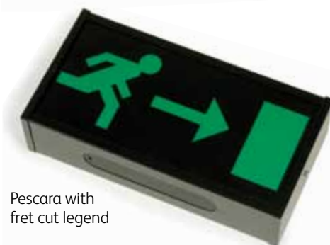
Pescara with fret cut legend