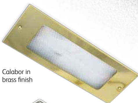
Calabor in brass finish