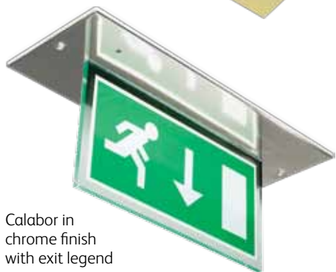
Calabor in chrome finish with exit legend